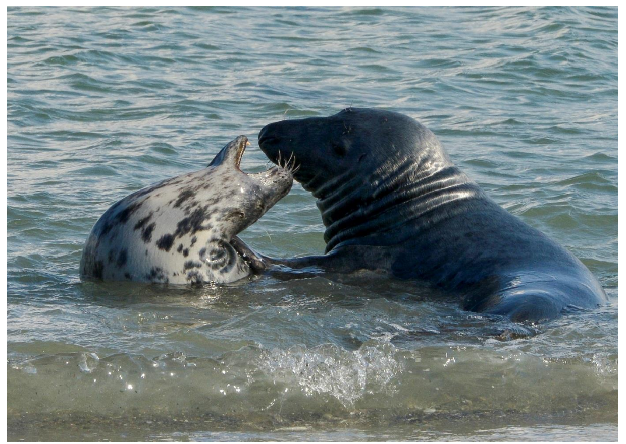
Grey seals in the water near Helgoland.

First year of almost complete monitoring by aerial surveys