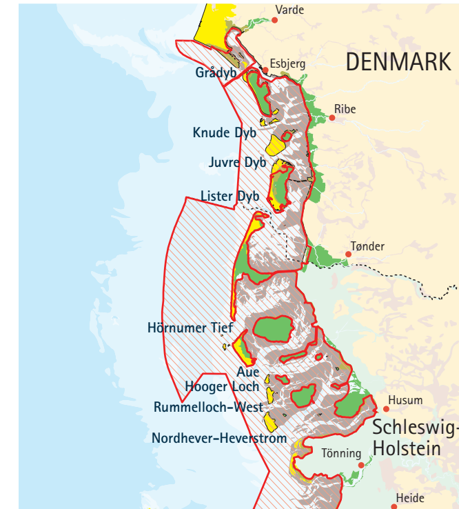
Tidal inlet systems of the Wadden Sea Area

Natural dynamics are an important asset of the Wadden Sea. In the trilateral Climate Change Adaptation Strategy (CCAS), natural dynamics are a leading principle with regard to climate change adaptatoin, as it increases the resilience and adaptive capacity of the Wadden Sea ecosystem. But there are limits to the capacity of the natural system to adapt. We do not exactly know these limits and they differ for each inlet system. Along the island coasts sand nourishments are executed for coastal maintenance. With these nourishments sediment is added to the coastal zone, which supports the system in adjusting to sea level rise.